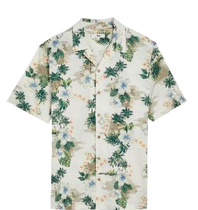
M&S COLLECTION SHIRT £32