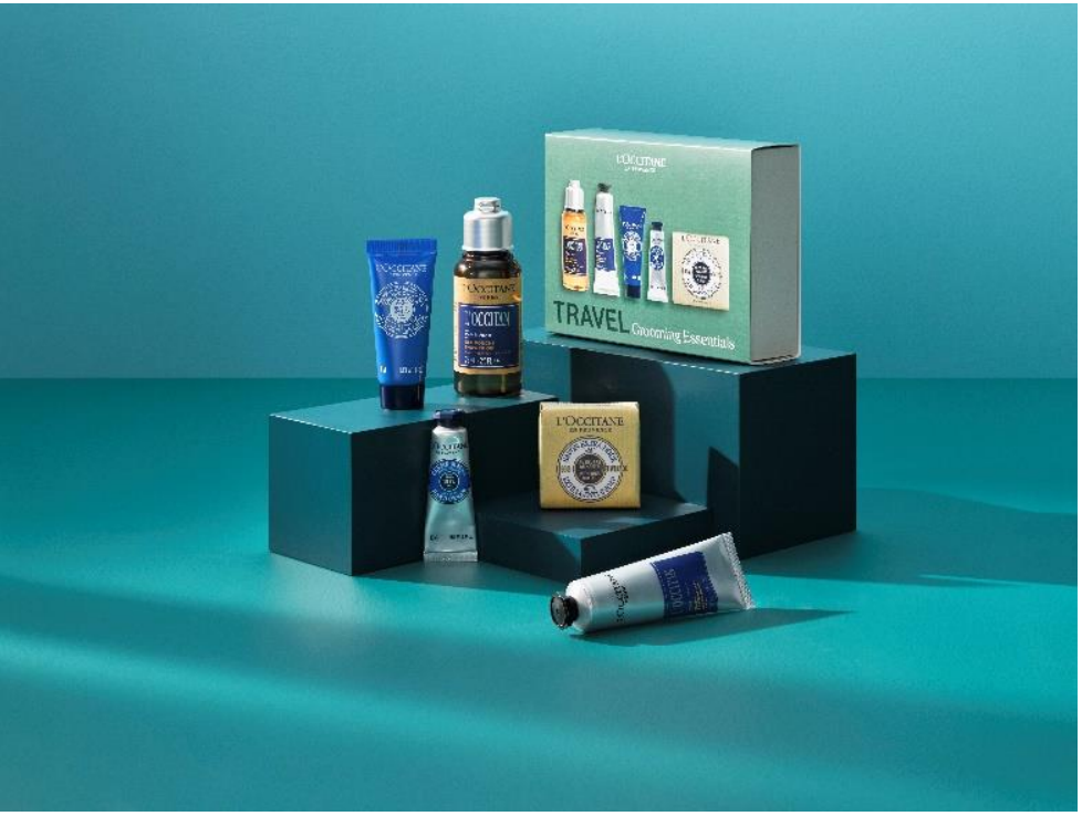
L'OCCITANE TRAVEL MENS GROOMING ESSENTIALS £22