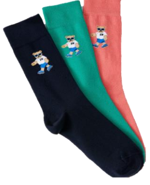
M&S COLLECTION SPENCER BEAR SOCKS £12